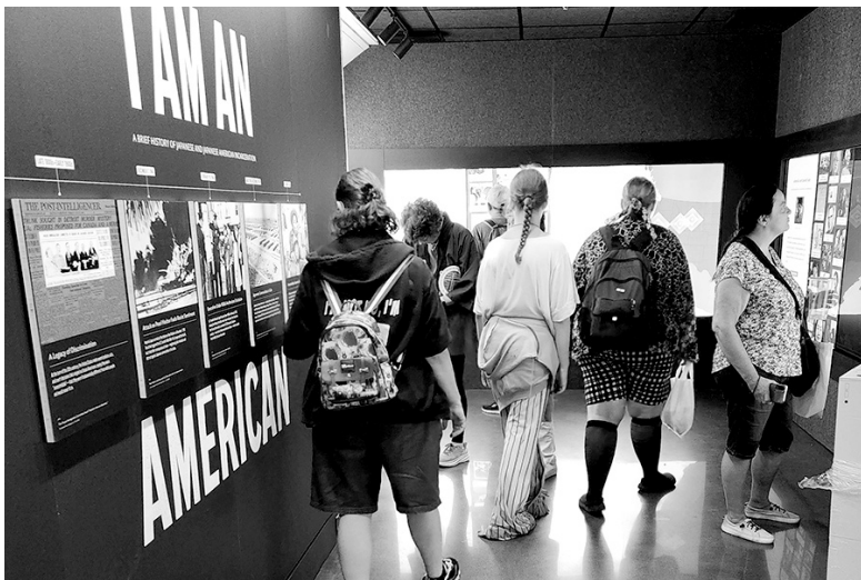
Visitors walking through