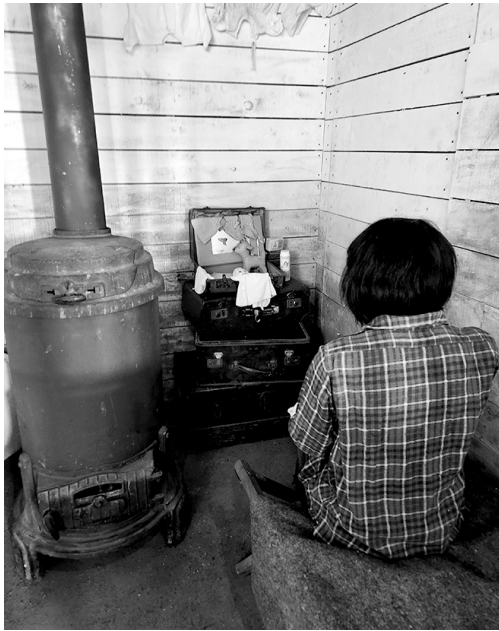
Refurbished horse stall recreation

The narration makes history more real through immersive-media digital touch screens, interpretive displays, and interactive maps. A visitor will also experience a replica 1942 horse stall living quarter. A background audio track simulating neighbors in other stalls chatting, whispering, sneezing, cough-