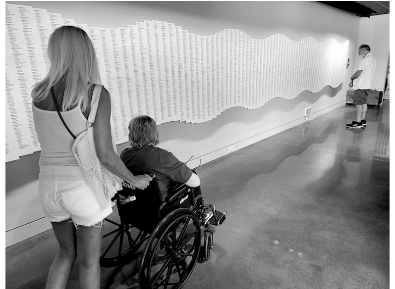
Remembrance gallery names